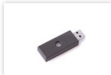
2.4G RF Adaptor